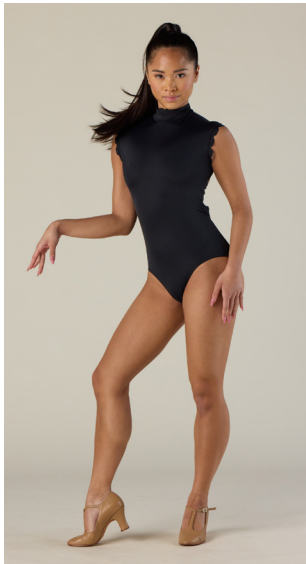
Musical Theater 1