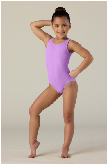
Musical Theater 1