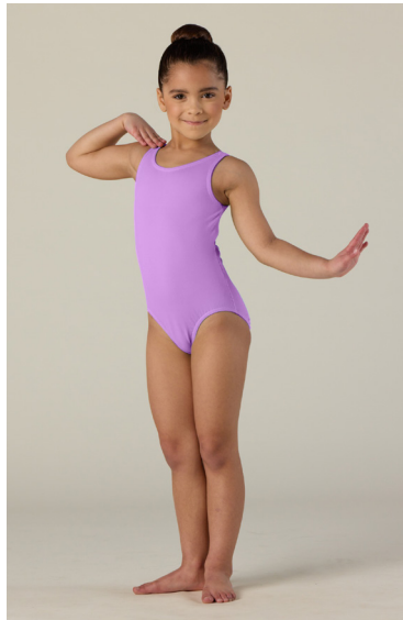
Musical Theater 2